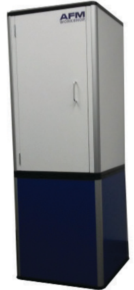
Q-Box shown with the optional base.

The Q-Box is the most cost effective and reliable product for reducing unwanted vibrations that degrade an AFM's resolution. Both structural and sound vibrations are filtered with the Q-Box's unique design.